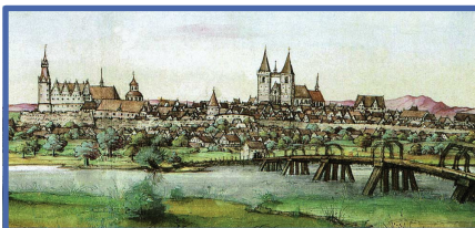
Wittenberg in 1536