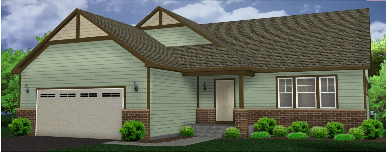
IMAGE/COLORS MAY NOT REFLECT ACTUAL CONSTRUCTED HOUSE